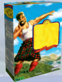
the related breakfast