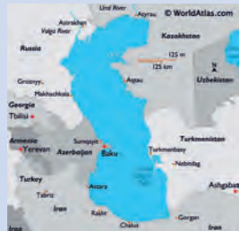
the expanse of water