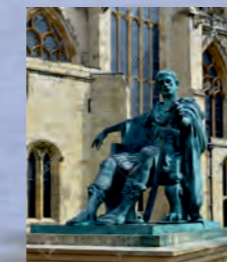
the building in the background